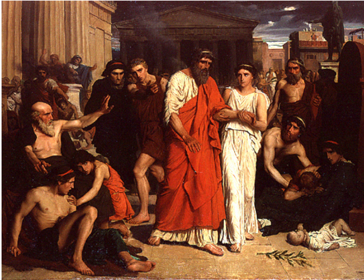
Fig. 3, Eugène-Jean Damery, Oedipus and Antigone , 1843, oil on canvas, École des Beaux-Arts